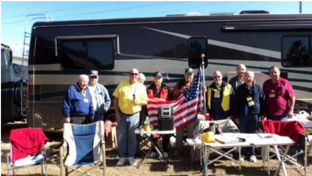
VETERANS AT PERRY, GA